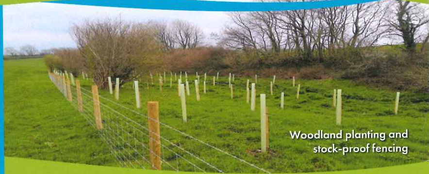
Woodland planting and stock-proof fencing