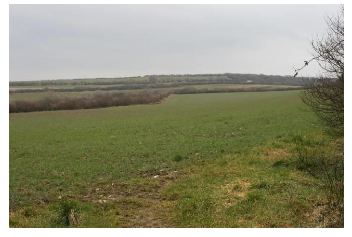
Survey points: SS259179, SS246178, SS242181, SS265211, SS266200, SS282226