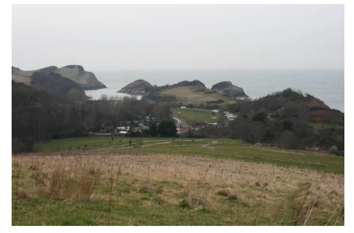
Survey points: SS567473, SS560478, SS556480, SS547481