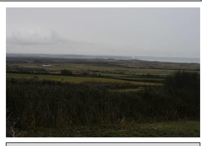
Survey Points: SS477380, SS470387 (from within LDU 403)