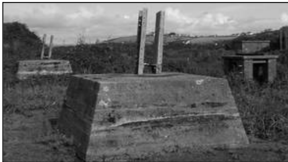
Metal struts to which a timber receiver tower was bolted still remain embedded in the concrete bases. An aerial cable junction box is on the right.

Most of the structures and features on private land can be viewed from the public highway. A transmitter block, still with its earth covering, stands adjacent to Burrows Lane at a point where the road enters the Burrows.