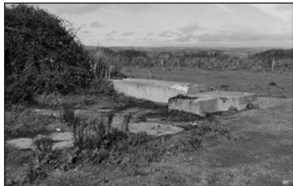
A plinth possibly for a generator.