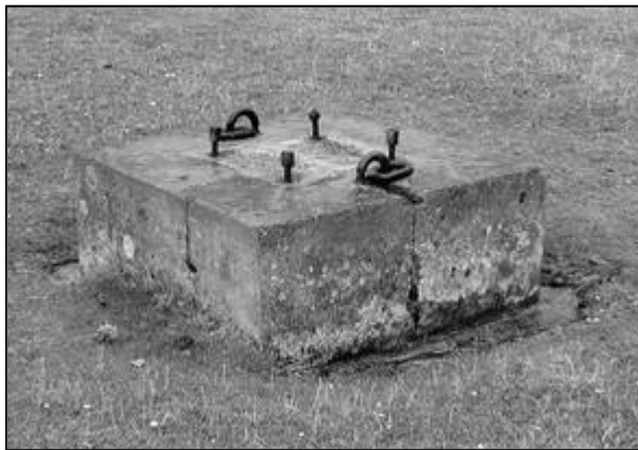
The concrete base of a transmitter mast.

Much remains of this former RAF station, both on the Burrows and on private land. Northam is a relatively well-preserved site.