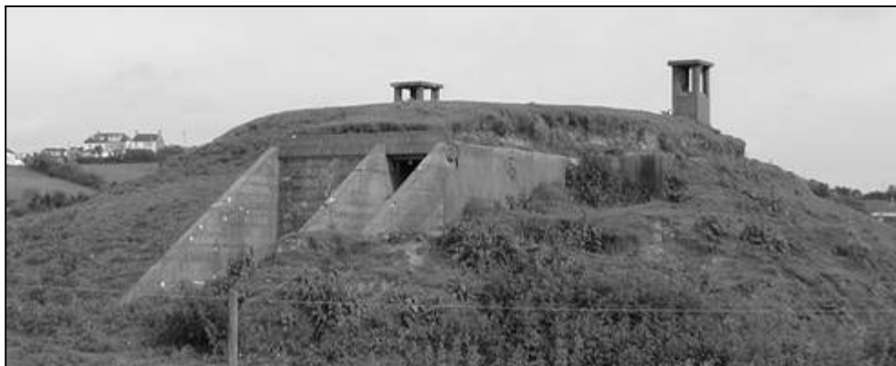
A transmitter block, adjacent to the Burrows.

There is no trace of the domestic area. A change of road layout in the late 1980s and early 1990s together with new housing have obliterated the site; bungalows have now been built where Nissen huts once stood 27 .