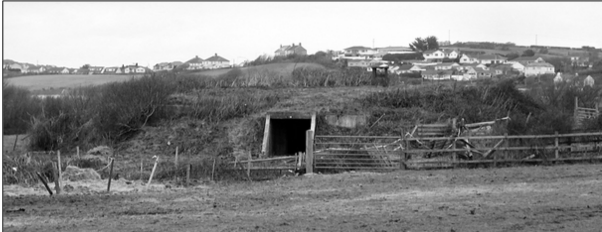
A receiver block.

Two buildings have not been positively identified and are illustrated below.