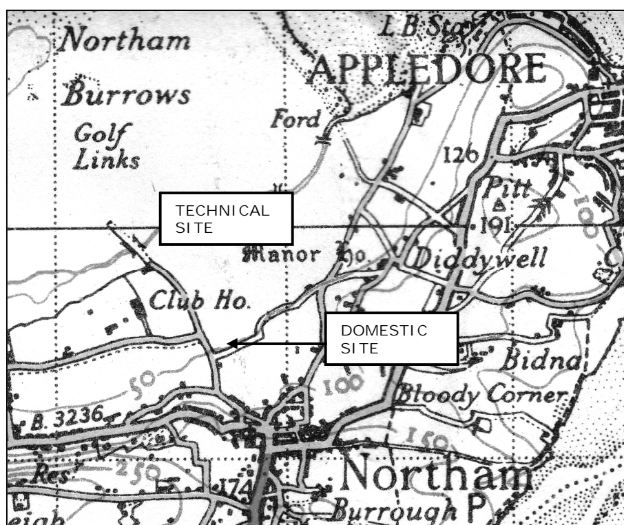
Enlarged extract from the 1946 Ordnance Survey 1:63360 New Popular Edition Map Sheet 163.

National Grid Reference: SS 44763003 (approximate centre of site)