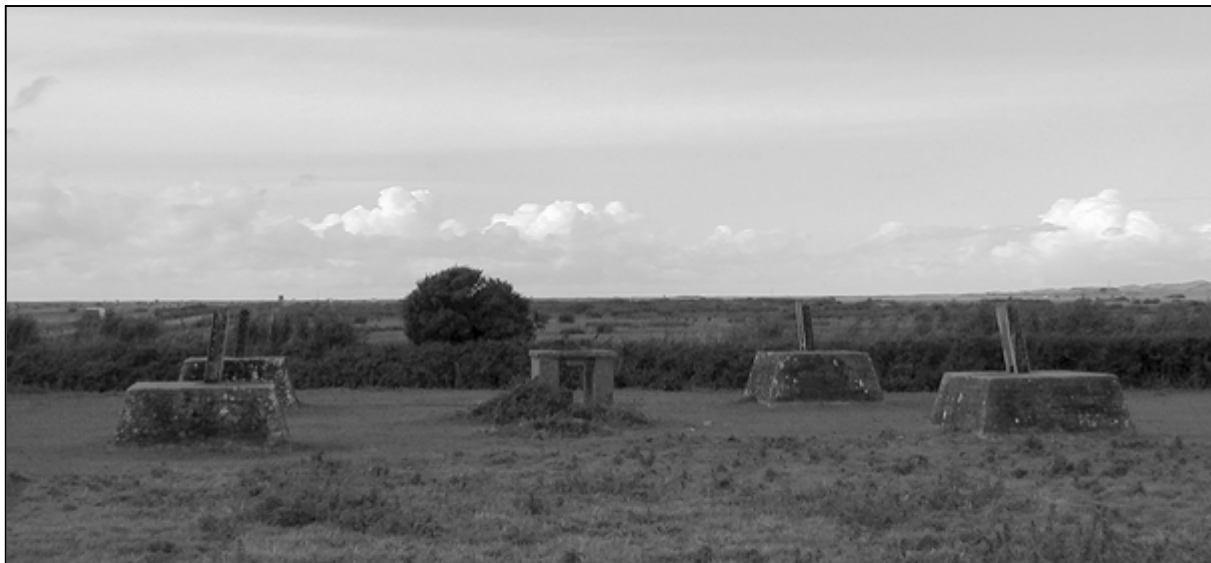
The four concrete bases of a timber receiver tower, together with an aerial cable junction box in the centre.