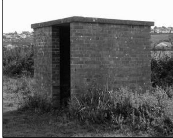
A brick hut of unknown purpose.