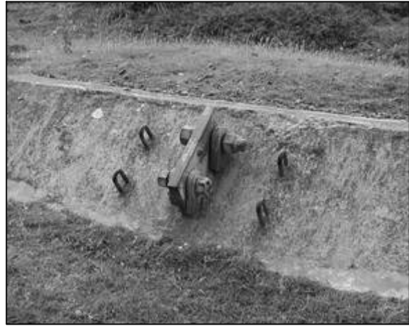
An aerial halyard anchor block. The illustration below (of a modern communications mast) demonstrates how halyards are anchored.

On the Burrows the square, concrete bases of the two pairs of transmitter masts can be identified, together with sets of aerial halyard anchor blocks. Here too are aerial curtain balance weight bases and aerial halyard balance weights. By survey it was possible to define the footprint taken up by the transmitter masts and their anchors (see Appendix One).