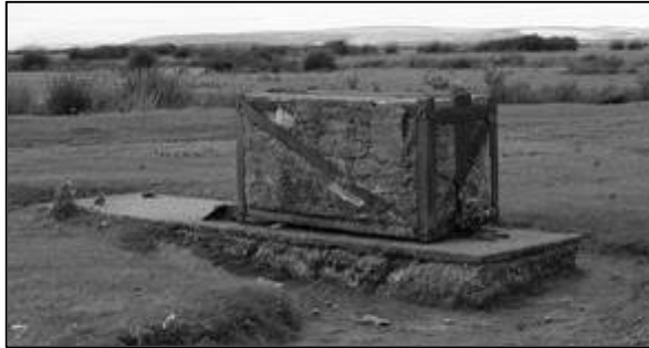
The remains of an aerial halyard balance weight.

Most of the structures and features on private land can be viewed from the public highway. A transmitter block, still with its earth covering, stands adjacent to Burrows Lane at a point where the road enters the Burrows.