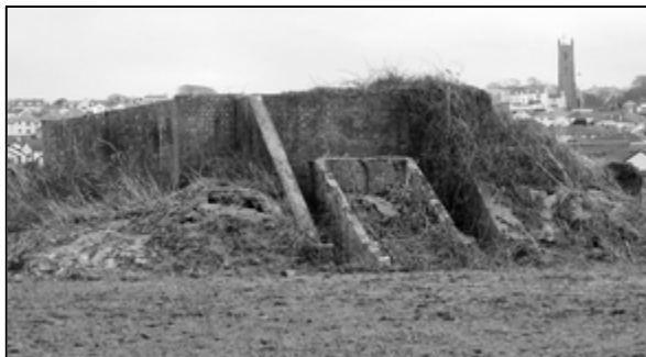
A putative ICH building with earth blast mound.

Two buildings have not been positively identified and are illustrated below.