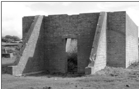
A putative ICH building with earth blast mound removed.

It is proposed that the buildings belong to an early phase in the development of the station and could have been ICH structures 29 .