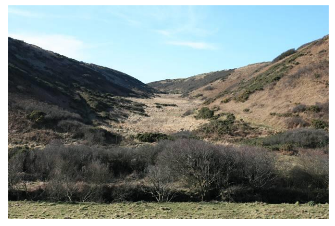
Survey points: SS238225, SS236227, SS234228, SS230231, SS228232, SS227233