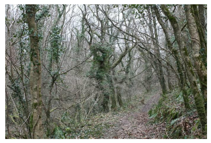
Survey points: SS241180, SS236177, SS234174, SS231172, SS218174, SS213177